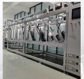
Whole machine life test 整机寿命测试