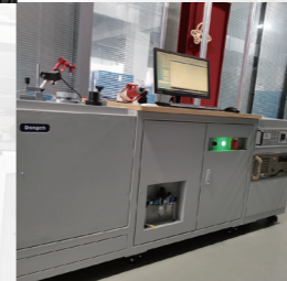
Suction test 吸力检测