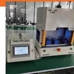
Air tightness tester 气密性测试仪