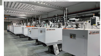
Injection molding workshop 注塑车间