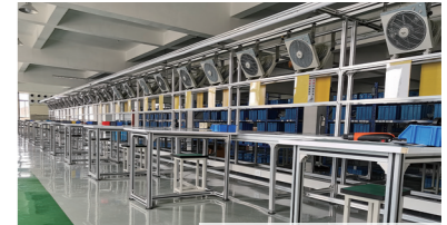
Production line 生产流水线

“追求卓越、成就不凡”，五维将在全球范围内继续拓展多元化服务体系，全面提升品牌价值。