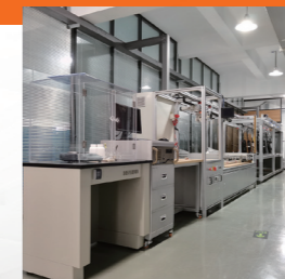
Energy efficiency test 吸尘器能效测试